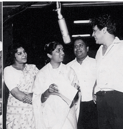
Nargis, Lata, Shankar and Jaikishan